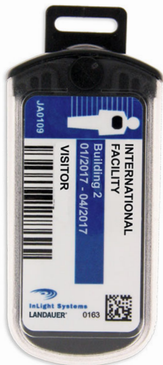
LANDAUER Holder Design